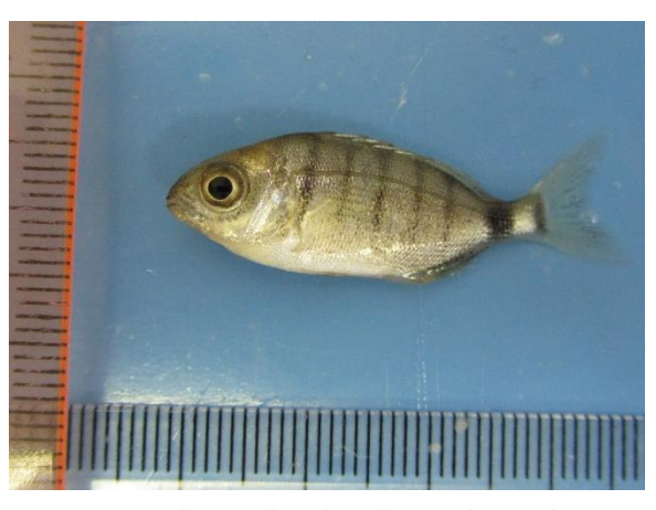
To assess juvenile growth and condition, white seabream, were measured and weighed before and after dissection.

Juvenile seabream were exposed for 3.5 weeks to either pristine or weathered polystyrene particles along with natural food items ( Artemia sp. nauplii). Microplastic densities were close to the conditions found in the natural habitat of the fish. The blue, fluorescent plastic fragments were 0.5 - 1 mm in size, small enough to be ingestible and approximately the same size as the Artemia .